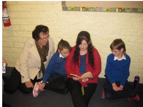
Reading Corner, Yr 2-4 students