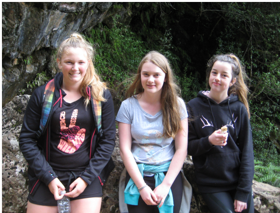
Rock Climbing, Outdoor Ed. Students (Yrs 9/10)

Each year a different group of the school family will be surveyed to widen the responses, which help in developing strategies as we work through the self-examining Quality Adventist Schools – School Improvement Framework.