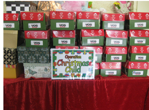
Operation Christmas Child Shoebox packing

Anglicare and Relationship Australia counselors have been involved on a needs basis to assist students to work through any personal and family needs. One of our Teacher's Aides has also completed a Counseling Degree and has taken part in work experience with the local Psychologist.