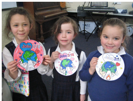
Spiritual Emphasis Week

Our mission is to promote a quality Christian education, that promotes values and positive relationships, leading to a commitment to Christ, and service to others.